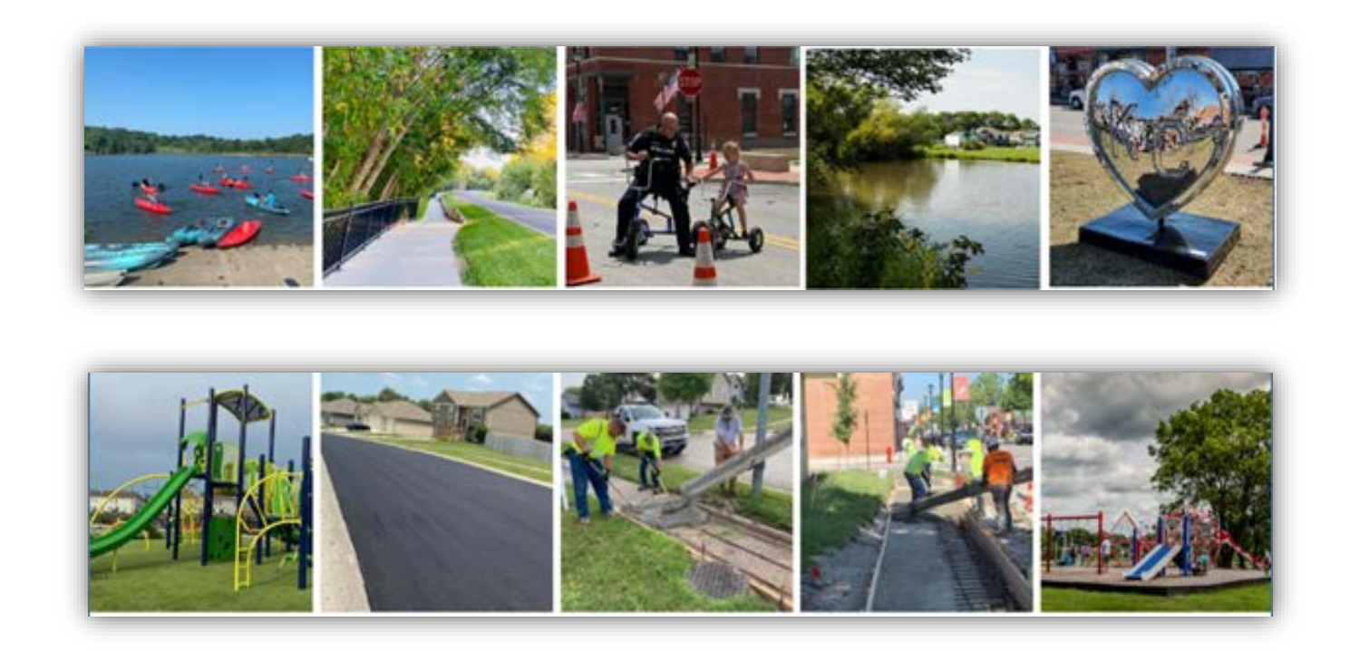
Prepared by the Finance and Administration Departments